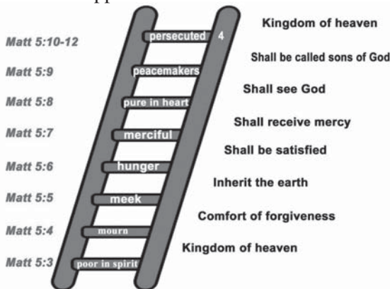
The Ladder to a Godly Life

Wishing every sister a Pleasant Journey to Holiness, to find the Secret of True Happiness!!