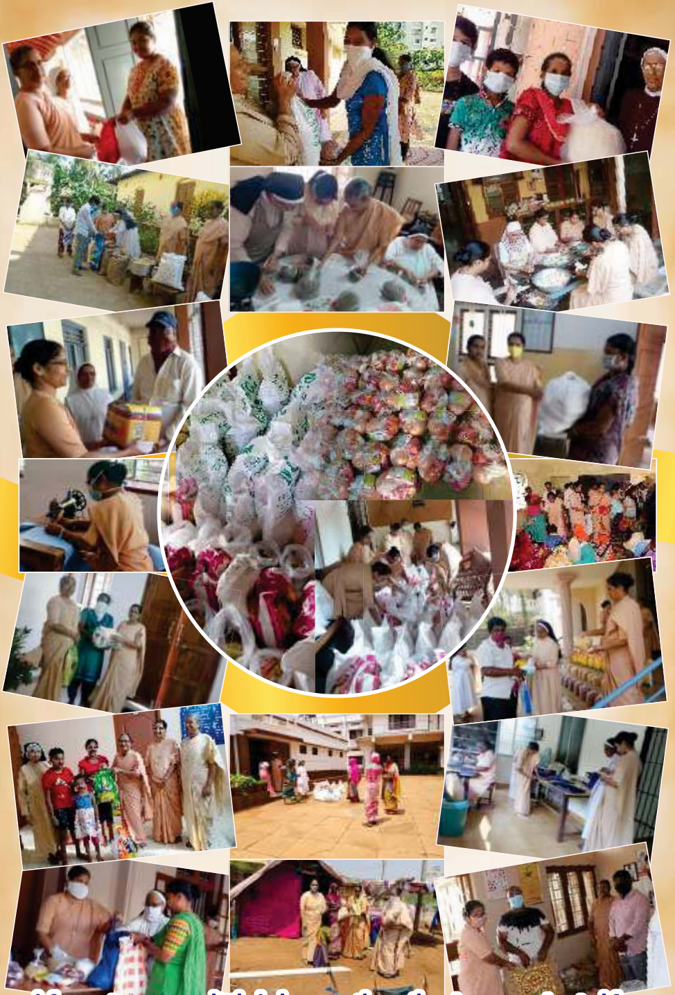
A fervent prayer, a little help, a gentle smile, gives meaning to life...