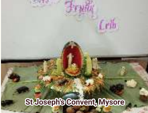
St Joseph's Convent, Mysore