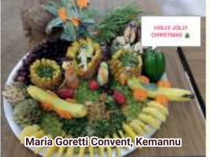
Maria Goretti Convent, Kemannu