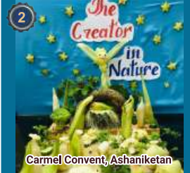
Carmel Convent, Ashaniketan