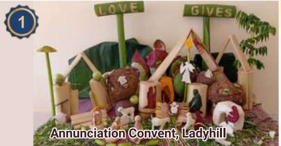
Annunciation Convent, Ladyhill