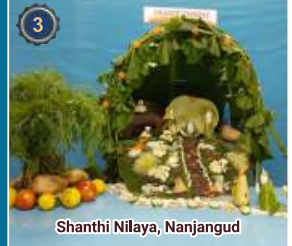
Shanthi Nilaya, Nanjangud