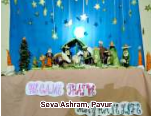
Seva Ashram, Pavur