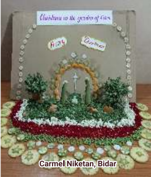
Carmel Niketan, Bidar