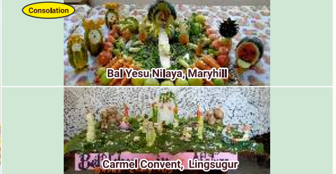
Bal Yesu Nilaya, Maryhill