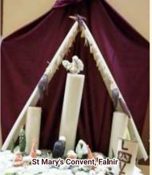
St Mary's Convent, Falnir