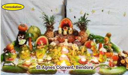
St Agnes Convent, Bendore