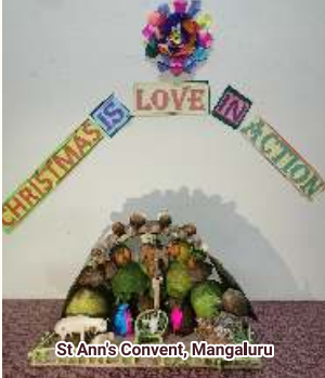
St Ann's Convent, Mangaluru