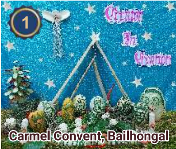
Carmel Convent, Bailhongal